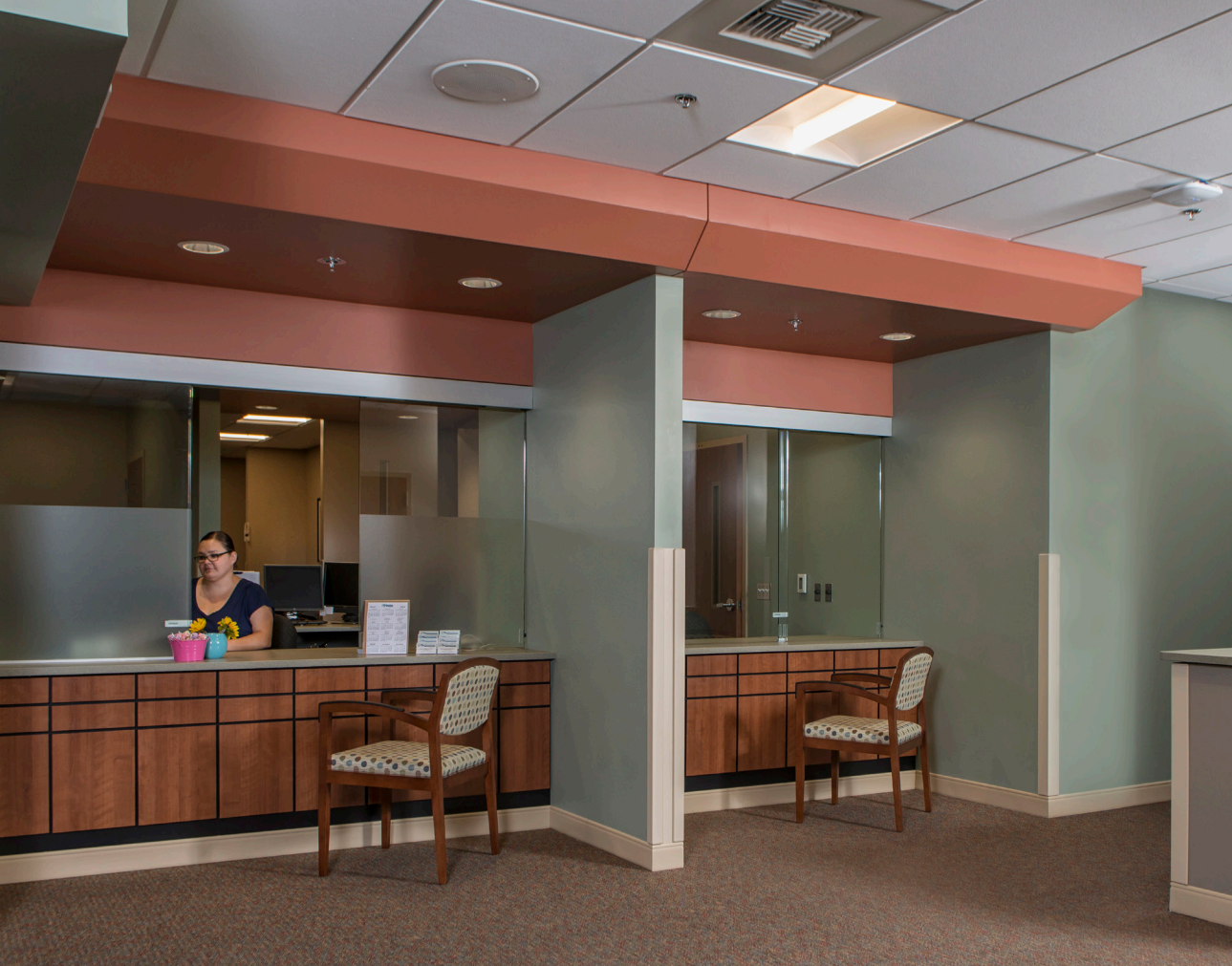
OBSTETRICS AND GYNECOLOGY CLINIC RECEPTION