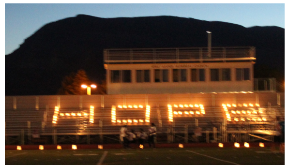
RELAY FOR LIFE