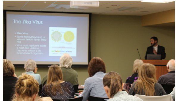
LUNCH & LEARN PEDIATRICS