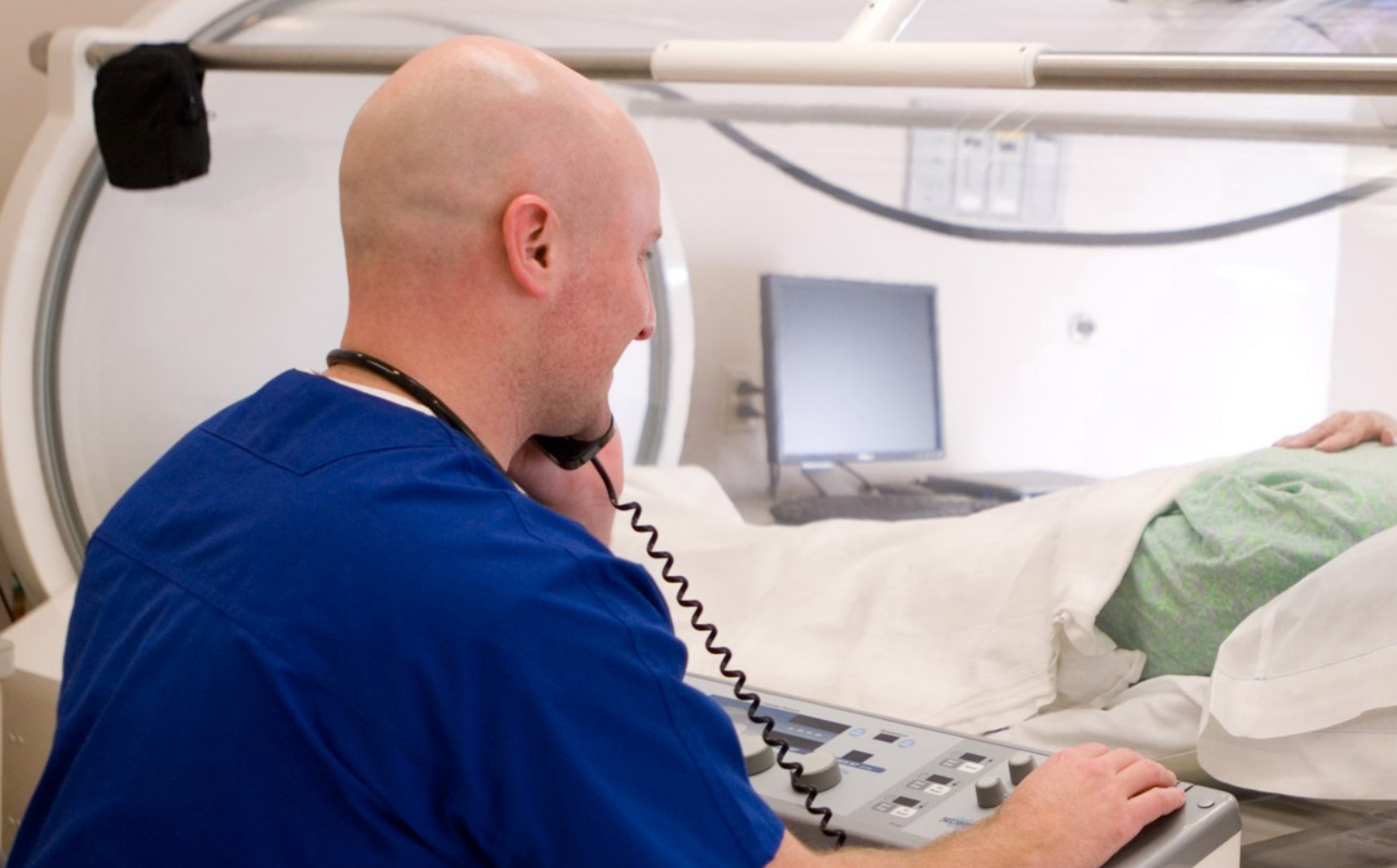
WOUND CARE PATIENT IN TREATMENT