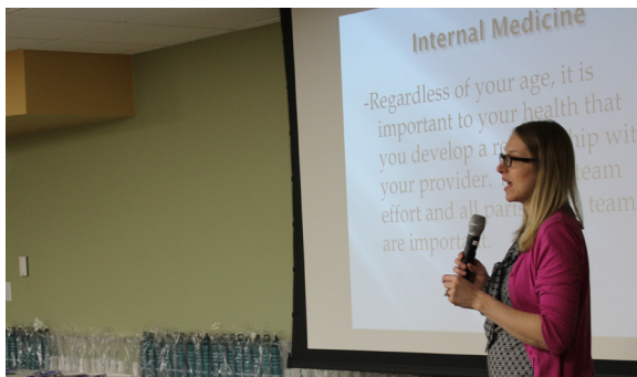
LUNCH & LEARN INTERNAL MEDICINE