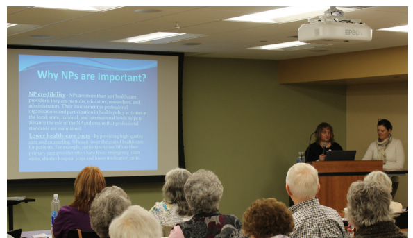
LUNCH & LEARN NURSE PRACTITIONERS