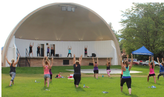
PACK THE PARK