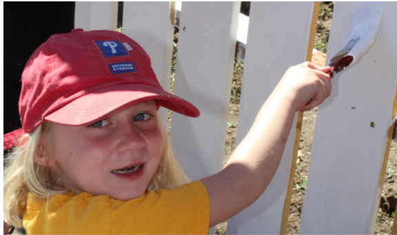
DAY OF CARING