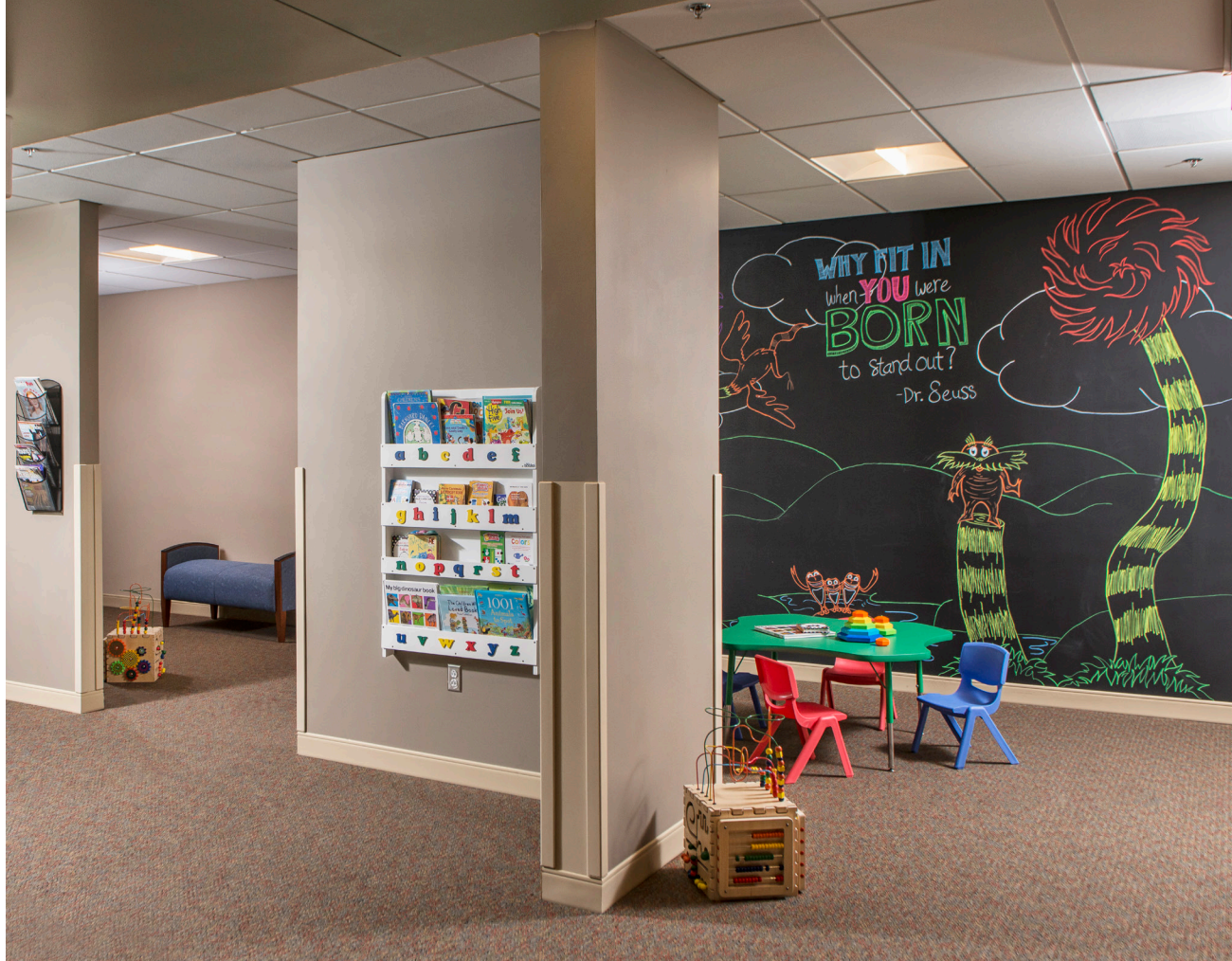
PEDIATRIC CLINIC WAITING ROOM